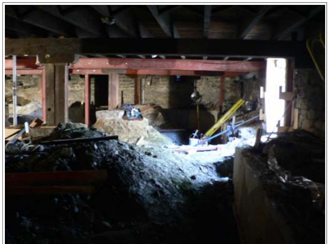
The excavation of the crypt with new steel girders in place.